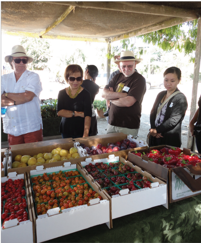
Hospital Leadership Team members learn about the wide range of crops Dwelley Farms grows, from tree fruit to sweet corn.