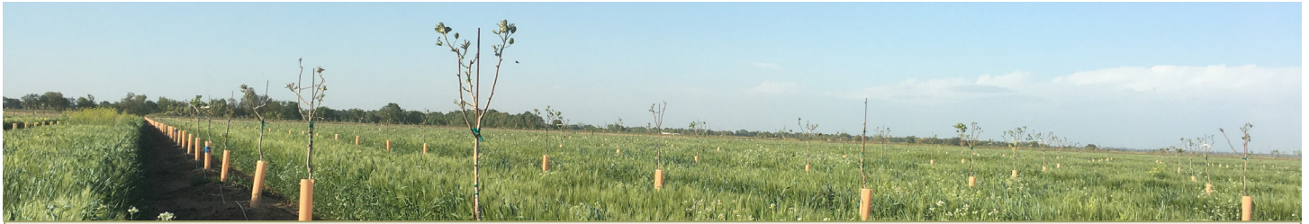
A young pistachio orchard with cover crop in between the rows.