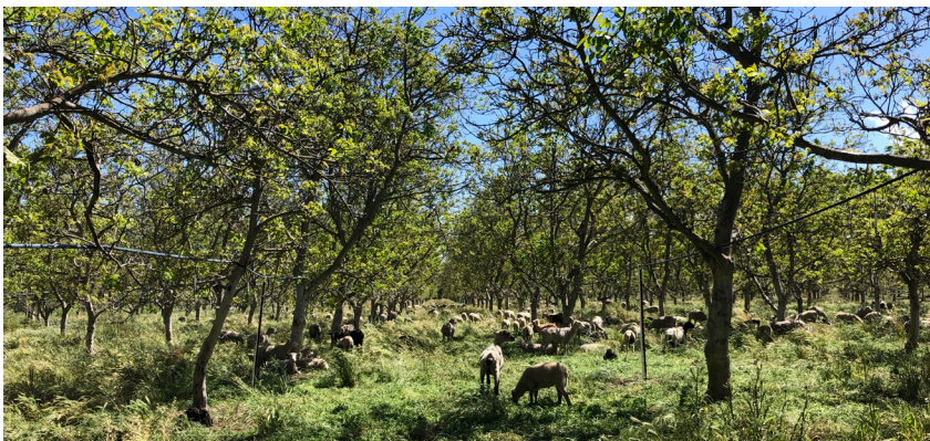
Sierra Orchards brings in sheep every year to graze in their organic walnut orchards in order to help manage their cover crop while simultaneously enhancing benefits to the soil.