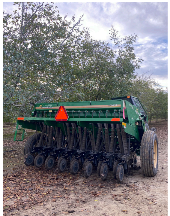
Cover crops are typically planted either with a seed drill or by broadcasting the seed. At River Garden Farms, they plant with a Great Plains no-till seed drill which allows them to plant cover crop seed with little to no soil preparation or disturbance.