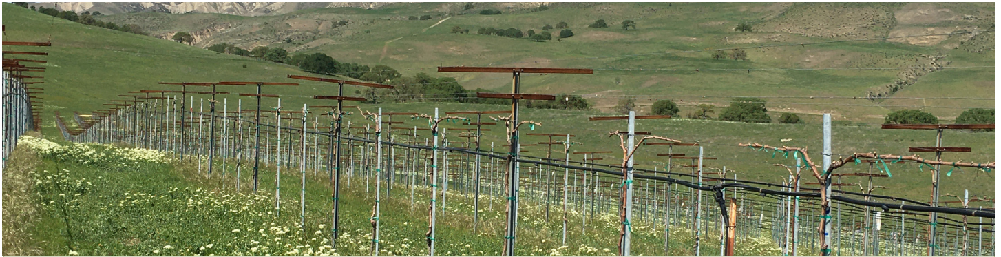
Paicines Ranch grows cover crops in their vineyards, not only to build soil carbon and feed soil biology, but also to provide forage for sheep which are brought in to graze the cover crop.