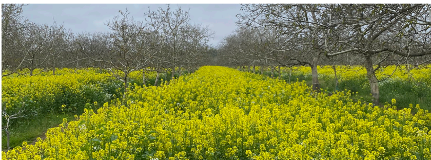
A field of mustard grows tall in between the walnut trees at Double A Farms. Here the mustard is used to help suppress plant-parasitic nematodes.